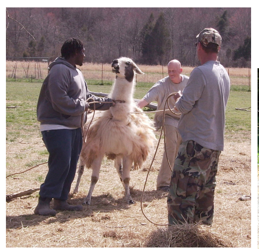
Restraining large animals